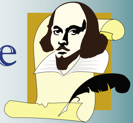
William Shakespeare On Deduplication

“To dedupe or not to dedupe, that is the question;