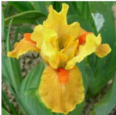
Gummy Bear (Chapman 2007) M

Standards light straw yellow, lavender midrib style arms darker yellow blended lavender; Falls Dark straw veined butterscotch with light straw rim. Bright yellow beards