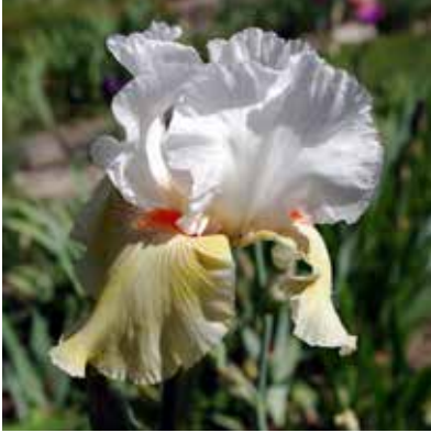
Frontier Lady (Chapman 2001) E M