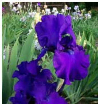
ULTIMATE DESIRE (John McMillen, R. 2015). Sdlg. 111114. TB, 30" (76 cm), M. S. veiy deep royal purple; style arms purple; F. same as standards; beards blue-gold in throat, purple end hairs tipped white, huge and bushy; ruffled. 074609: (Gnus Flash x Fog-bound) X Kinkajou Shrew.