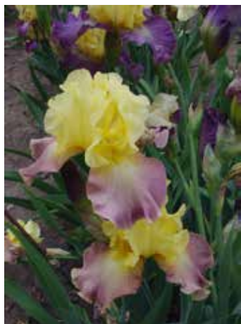
STILL THINKING (John McMillen, R. 2015). Sdlg. 121114. TB, 36" (91.5 cm), VE. S. lemon- ade yellow, laced, upright; style arms deeper yellow; F. light dusty rose streaked yellow-tan, yellow spot around beards, narrowly edged lem- onade yellow; beards deep gold. Darcy's Choice X 074211: (Gnus Flash x Fogbound).