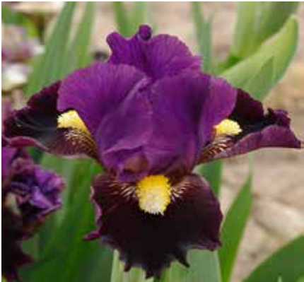
Beckoning (T. Johnson 2013) M

15" Standards and style arms purple; falls near black, slight white ray pattern around beard; beards bright yellow. Sweet fragrance