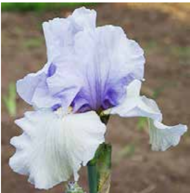
Eternal Blues (J McMillen 2015) L

A cold hardy garden plant. High bud count. (Up to 12 buds in Zone 4 garden) a very long bloom season. Fast increases and reliable performer, closed standards are white with pink blushed centers. Falls are peach with narrow white rim and radiating lines around coral red beards. Faint floral fragrance