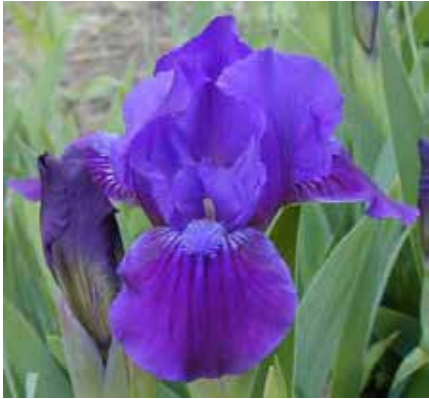
Autumn Jester (Chapman 2000) E

8" Bright orange self with darker fall lines HM AM Cap-W