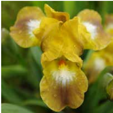
Toffee Time (Chapman ) E M