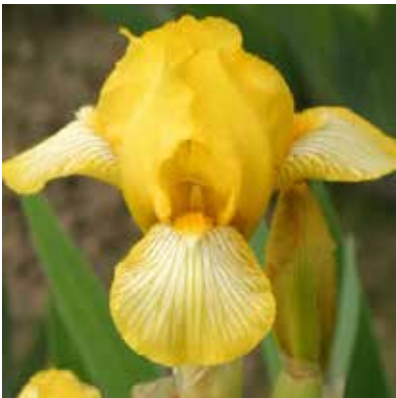
Fashionably Gold (K Fisher 2010) M

Delicate violet lines and plicata stitching on white ground, white beard