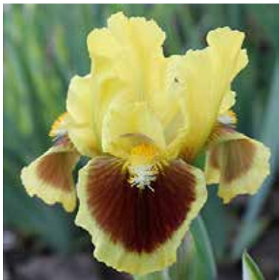
Ultimate (T Johnson 2003) M

14" Standards and style arms mid blue-violet; Falls same, darker spot around beard; Beards orange in throat, blue-violet end. Sweet fragrance