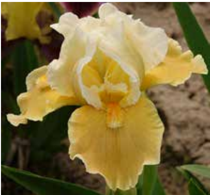
Bennett's Star (Aitken 2013) M L

14" yellow standards; Maroon falls edged mauve; Blue beards HM