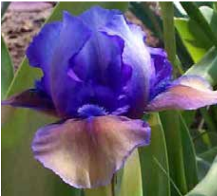
Blueberry Tart (Chapman 2002) E