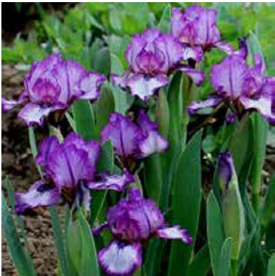
Celebrate (Black 2007) M

14" Claret Purple with darker center and veins; lavender beards. HM AM