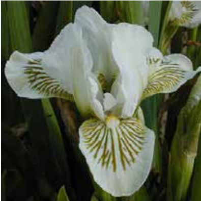
Snow Tree (Sobek 1990) E M