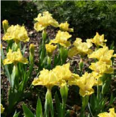
Cream Pixie (Chapman 1996) L