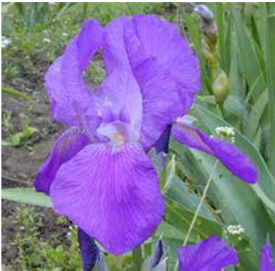
Caprice (Vilmorin 1904)

A bicolor. Standards pink; falls pearl-violet with orange beards HM AM