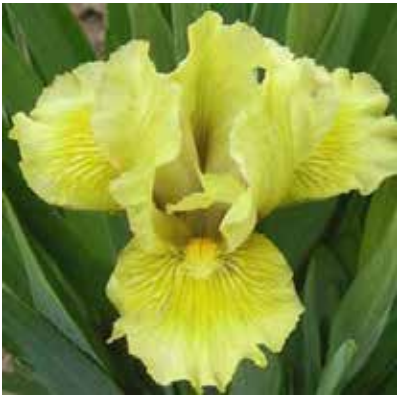
Lookout Sunshine (Chapman 2009) E M