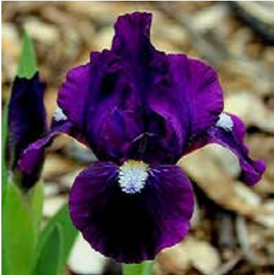
Wish Upon A Star (Black 2006) E M L