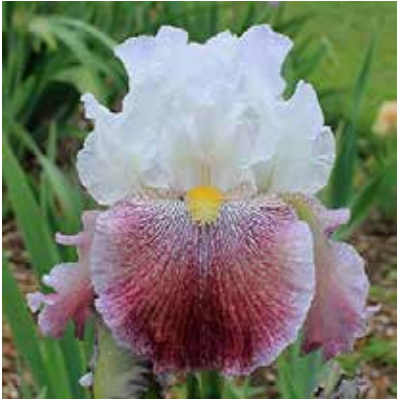
Thundering Ovation (Black 2007) E M