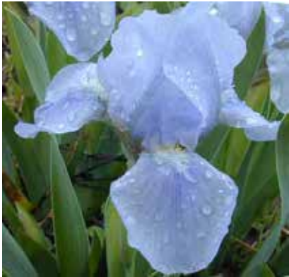
Sleepy Time (Schreiner's 1987) VE

8" Ruffled diamond dusted light blue, snow white beard HM