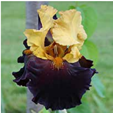
Kathy Chilton (KERR 2006) M

Standards Upright, ruffled cool white, style arms white with light lilac lip; falls large cool lacy white; beards light yellow middle and throat, tipped white