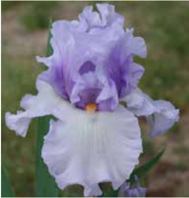
Cold Front (Chapman 2013) M