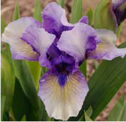
Cookie Monster (D Spoon 2013) M L