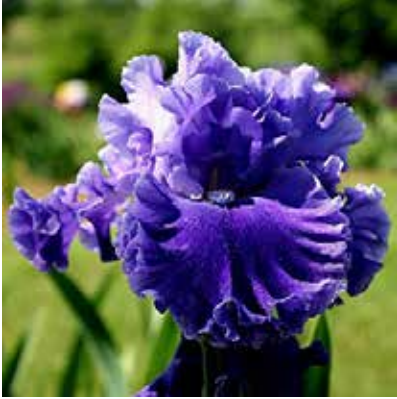
Sea Power (Keppel 1999) M