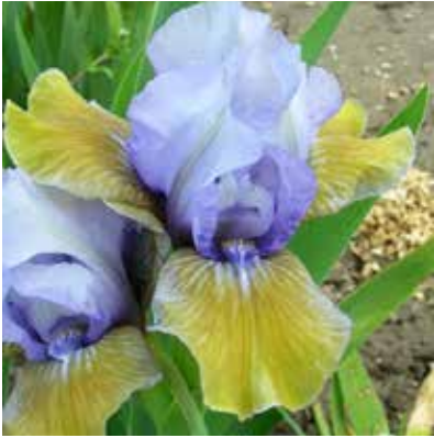
Ruth's Choice (Chapman 2013) M