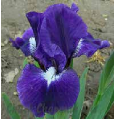
Urban Myth (Chapman 2011) E M