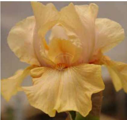
Carved Pumpkin E M