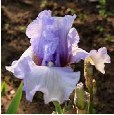
Northern Frost (J McMillen 2017) VL