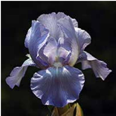
Raindance Returns (Aitken 2004) L