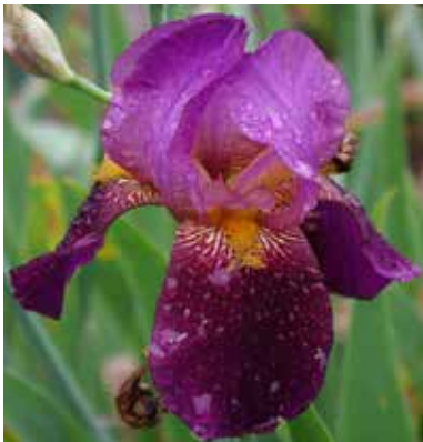
City Of Stratford (Miles 1946) Historic Canadian Introduction

Standards orchid; Falls orchid with shoulders washed yellow, beards golden yellow