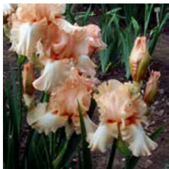
NEAT AND TIDY (John McMillen, R. 2015). Sdlg. 091214. TB, 32" (81 cm), VE-M. S. clear medium pink; style arms pink; F. clear medium pink paling to a near white centre area; beards bright tangerine-red; ruffled. 078189: (Olympiad x Fogbound) X 0711109: (Clean/vater River x Fogbound).