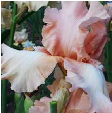
Neat And Tidy (J McMillen 2016) VE M

Standards medium blue; Falls darker blue; paler margins, white rays around beard; Beards blue with white tips HM AM JW