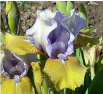
Blue Hat Boy (Chapman 2007) E

12" Standards blue-lavender, dark at petal base blending to light blue-lavender; Falls dark blue-lavender at hafts blending lighter at pedal edges; beards white. Slight sweet fragrance