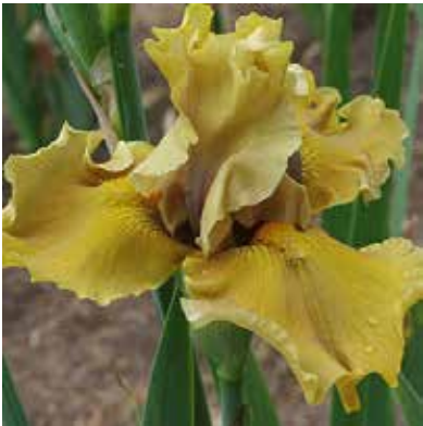
Eternal Blessings (J McMillen 2013) L