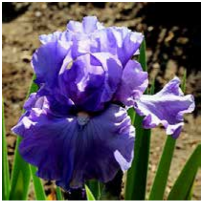
Trusty Blue ( J McMillen 2017) M

Medium blue self, beards orange in throat, pale blue at end