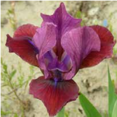
Jeweler's Art (Lankow 1993) M

14" Intense orange-yellow; Falls darker Has rebloomed in zone 4