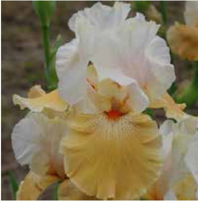
Eramosa Peach Sorbet (Chapman 2014) E