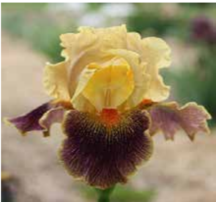
Delirium (M Smith 2001) M

Standards greyed hyacinth violet, greyer toward edge, style arms have greyed maple crest; Falls greyed violet shading to mauve taupe shoulders honey beige ground visible on upper third; beards terra-cotta to tomato red in throat.