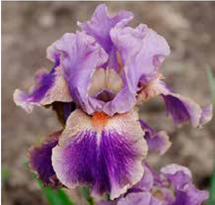
Bugaboo (Keppel 2006) M