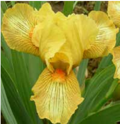
Yellow Hornet (Chapman 2012) M

14" Dark purple, with white area around white beards, small white dart at end of beards