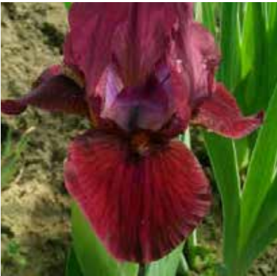
Red Rabbit (Spoon 2002) E M

Blue-purple standards; purple-black falls ; Beards yellow in throat, white in middle, blue at end