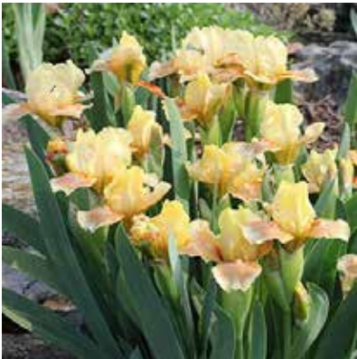
Classic Sunrise (B Jones 2005) M

Standards purple; Falls washed purple plicata on white; Blue beards HM AM