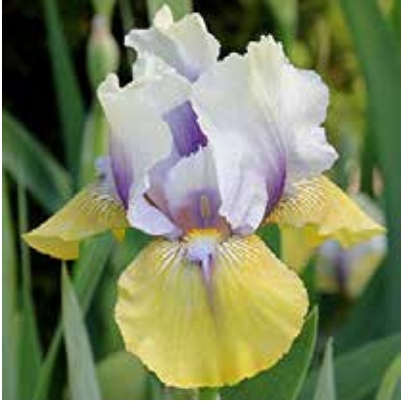
Double Your Fun (Aitken 2000) E M