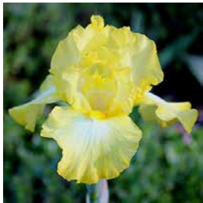
Limonada (Keppel 2007) M

Light yellow self; beards yellow in throat, light blue at end Might rebloom