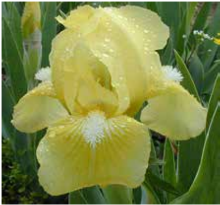
Baby Blessed (Zurbrigg 1979) E

13" A purple self that reblooms at IB height. Very reliable rebloom. Reblooms in Winnipeg zone 2a rebloomer