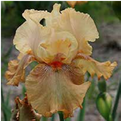
Butter Almond Crunch (Granatier 2017) E M