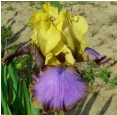
Plum Ringer (Chapman 2009)