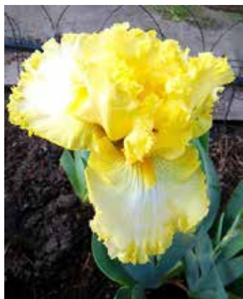
KRISTIQUE (Penny Santosham, R. 2015). Sdlg. 11-E4-14. IB, 26" (66 cm), M-L. S. lemon yellow; style arms dark lemon; F. white, shading to lemon edge; beards lemon-gold, thick; very lacy and ruffled; slight sweet fragrance. Beverly Sills X Heritage Lace.