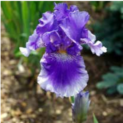
Money In Your Pocket (Black 2007) M L

Standards medium blue; Falls darker blue; paler margins, white rays around beard; Beards blue with white tips HM AM JW