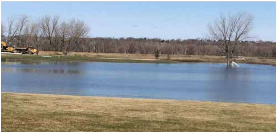
Assiniboine River in flood mode