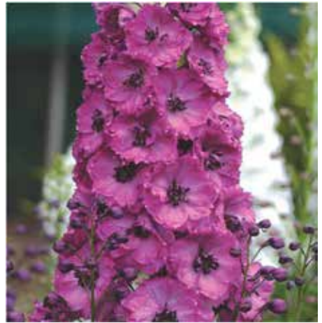
Delphinium Pink Punch

Anyone who is a "Hort Member" and looking for speakers—I have been informed "Lee Valley Tools" have people available to speak at your club.