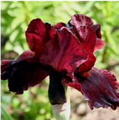
Cranapple (Aitken 1995) EM

Phlox purple with darker falls: Shading to blue at hafts; Grape fragrance