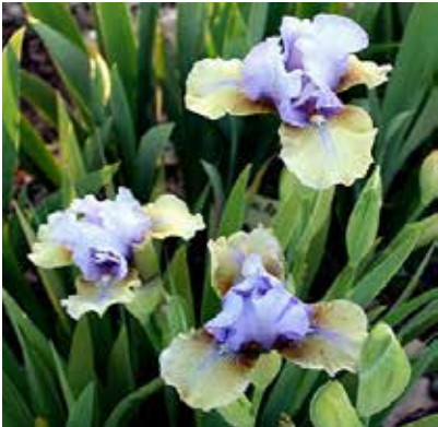
Fast Forward (Aitken 2002) M

Standards pearl white, midrib flushed deep violet; Falls soft butter yellow, beards yellow Good rebloomer