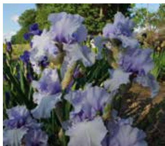
MOSTLY GHOSTLY (John McMillen, R. 2015). Sdlg. 082114. TB, 34" (86 cm), M. S. cool light foggy blue; style arms light blue; F. light blue aging to match the icy white center area; beards yellow in throat, ends white; slight fragrance. Yaquina Blue X unknown.