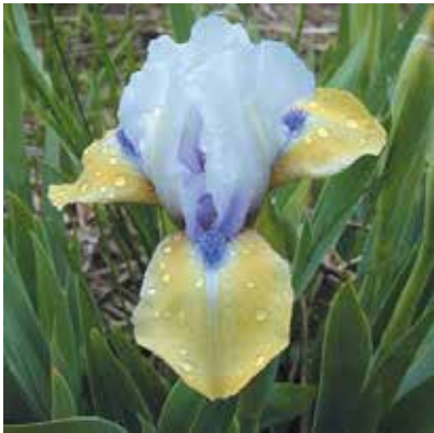
Summer Recall (Chapman 2003) E

13" Standards blue-violet, darker at base; style arms blue-violet, Falls Olive, blue lines at hafts, beards blue-violet, hairs tipped olive. Reblooms