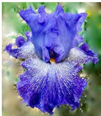
PRANKSTER (Penny Santosham, R. 2015). Sdlg. 11-B6-14. IB, 26" (66 cm), M. S. silky cerulean blue; style arms cerulean blue, gold tips; F. dark cerulean blue, fine white pinstripes over entire petal; ruffled and laced; slight spicy fragrance. Cascadian Rhythm X Laced Cotton.