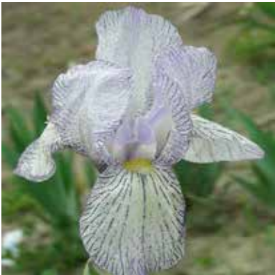
Eramosa Cloud Drifter (Chapman 2009) M L

Delicate violet lines and plicata stitching on white ground, white beard