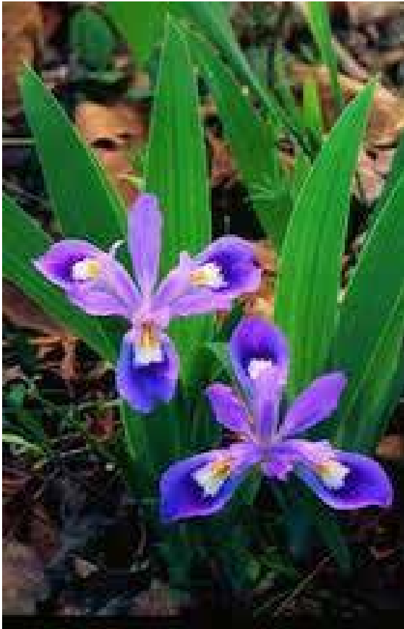
Dwarf Crested Iris

Normally the chromosome number is 2n=32 , although Langley in 1928 gave the number as 2n=24 .