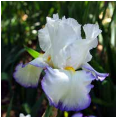
Queen's Circle (Kerr 2000) M L

Standards yellow; Falls violet with tan rim; yellow beard