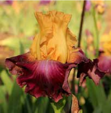
Bright Awakening (McMillen 2017) M

Standards Orange-apricot; Falls orange-apricot yellow at center; beards tangerine HM