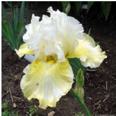
Melted Butter (Chun Fan 2004) M L

Self. Standards nicely domed, soft blush pink petals are heavily ruffled. Mauve mid-rib with light green veining. Falls mid pink washed smoky mauve with slight overlay of silver. Dark mauve marking at hafts. Silvery white line extends from beards.