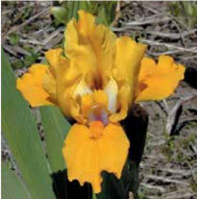
Juiced Up (Chapman 2003) E

14" Intense orange-yellow; Falls darker Has rebloomed in zone 4