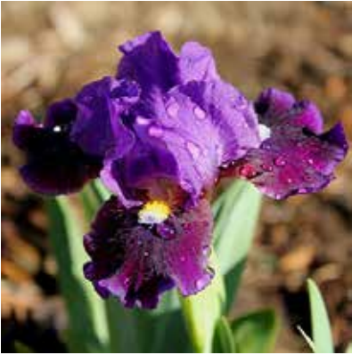
Pulsator M