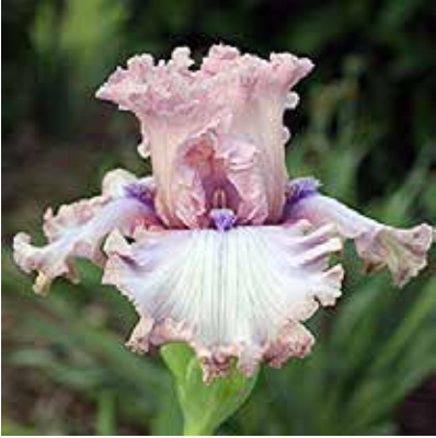
Don't Stop Believing (T Johnson 2013) L