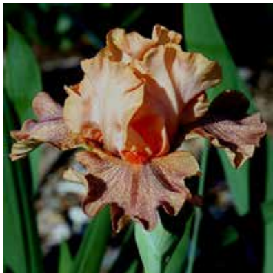
Spiced Peaches (Black 2004) M