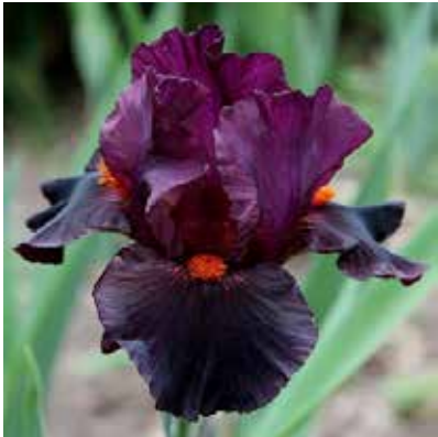
Garnet Slippers (Keppel 2004) M

Burgundy standards; Falls reddish black, beards mandarin red HM AM SM