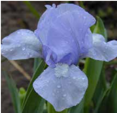
Blue Wind (Spence 1982) E

Standards pale buff pink, mid red-violet plicata stitched edge, random dotting over center; dark purple-black midrib; style arms red-grape crest and midrib, light rose edge; Falls buff-cream, widely spaced purple-black eye lash lines along beards extending \frac{3}{4} way down falls; grape sanding on outer edge of haft; beards red-orange in throat, mid-orange in middle, white ends, hairs based white. Slight sweet fragrance. Rebloomer