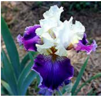
MARDI GRAS DANCER (R. Granatier, R. 2015). Sdlg. 11-151. TB, 36" (91.5 cm), ML. S. pale cream-yellow, arched and overlapping; style arms pale cream-yellow; F. plum, heavily veined amethyst, light violet rim, velvety lilac sheen extending from beard; beards old gold. Stilettos X Dancing Star.