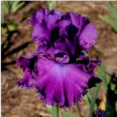
Majestic Ruler (Schreiner 2007) M L