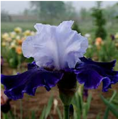
World Premier (Schreiner 1998) M L

Standards and Falls Billowing deep cornflower blue; lavishly ruffled form with dark blue beards HM AM JW DM