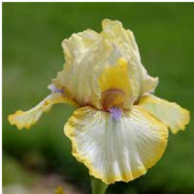
Intermediary (Sutton 2005) M

Burgundy standards; Falls reddish black, beards mandarin red HM AM SM