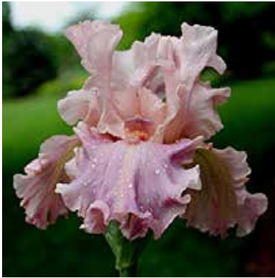
Lovers Holiday (Granatier 2017) E M L