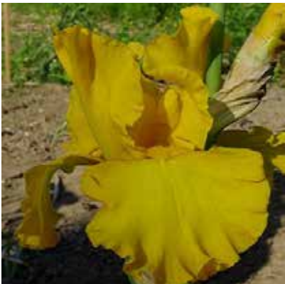
Dazzling Fantasy (J McMillen 2015) M L

Standards light lilac violet gradually getting darker towards midrib and base; style arms light blue-violet; Falls light blue-violet, Beards coral red with blue-violet tip> Slight sweet fragrance