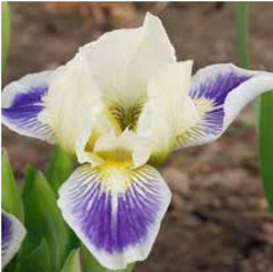
Dazzle Baby (Spoon 2013) M L

Standards grey-green, violet-blue edge, erect style arms violet-blue midrib and crest, violet edges; falls complex blending of grey-green and violet-blue, wide horizontally flared; beards darker violet-blue, tipped bronze in throat; ruffled slight spicy fragrance