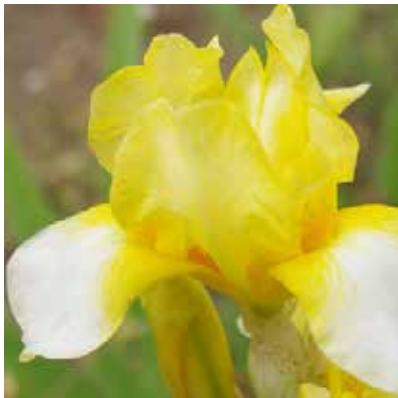
Rosemary Brown (Chapman 2014) M

Plicata Standards and falls white dotted red-violet. Beards white pale yellow in throat HM