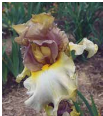
EXCEEDINGLY STRANGE (John McMillen, R. 2015). Sdlg. 112114. TB, 31" (78 cm), M. s. medium mahogany-red center blending to golden-tan edge; style arms gold, purple lip; F. light golden-tan brushed mahogany-red, center area slightly lighter, yellow streak extending from end of beard; beards deep golden-orange; ruffled. Crowned Heads X Golden Panther.