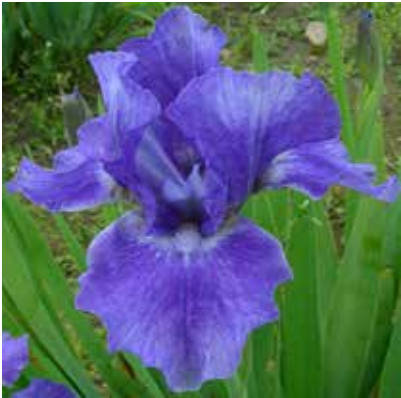
Eramosa Stone Washed (Chapman 2015) ML