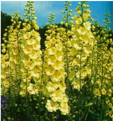
Elegant Silk Delphinium

At one hort meeting I learned of two of our members who are into hybridizing or propagating other things. One speaker told us he never has weeds in his garden, just natural vegetation. (Good thought). If anyone is looking for a special plant or bush let us know and maybe we can find it close to home for you. I found a peony and a delphinium grower so I am looking forward to seeing her bloom season. I have wanted a yellow and pink delphinium for years.