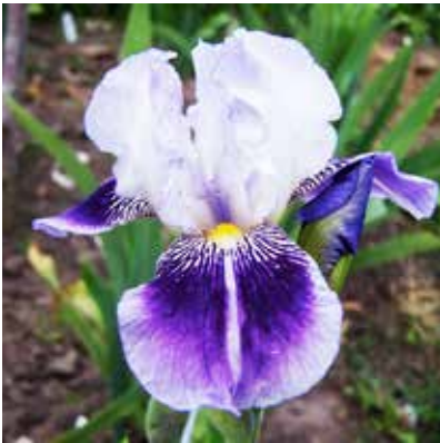
Dividing Line (Bunnell 2005) M

Violet, Falls with dark violet spot & white line from yellow beard to petal edge.