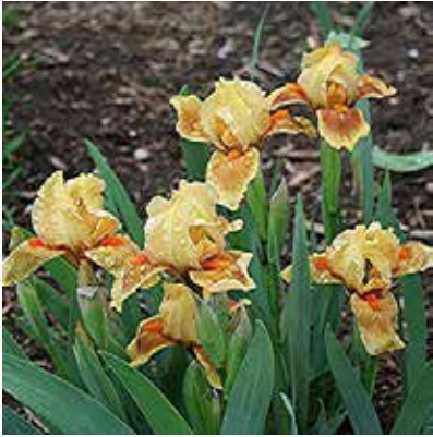
Little Firecracker (Chapman 1997) M