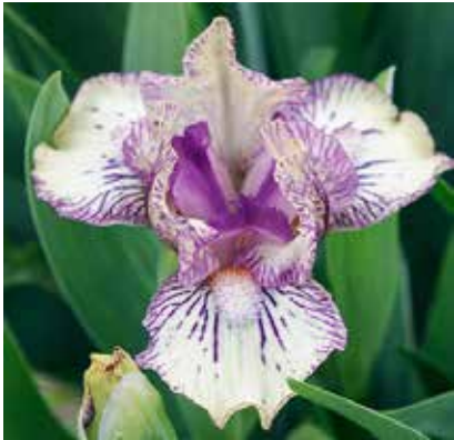
Beetlejuice (Black 2013) E M

Standards pale buff pink, mid red-violet plicata stitched edge, random dotting over center; dark purple-black midrib; style arms red-grape crest and midrib, light rose edge; Falls buff-cream, widely spaced purple-black eye lash lines along beards extending \frac{3}{4} way down falls; grape sanding on outer edge of haft; beards red-orange in throat, mid-orange in middle, white ends, hairs based white. Slight sweet fragrance. Rebloomer