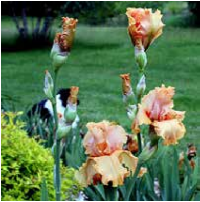
Autumn Riesling (Schreiner 2006)

Standards Orange-apricot; Falls orange-apricot yellow at center; beards tangerine HM