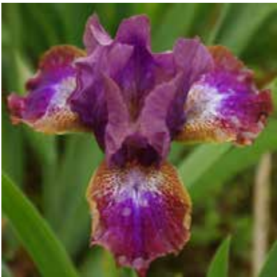
Magneto (Chapman 2014) E

Standards light butterscotch, falls darker butterscotch, beards reddish orange