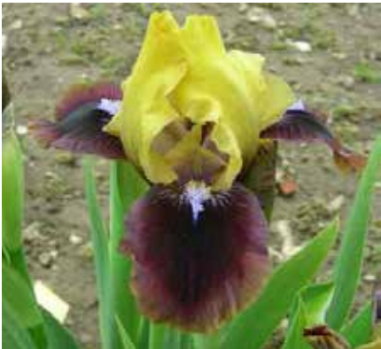
Being Busy (Hager 1993) M L

15" Standards and style arms purple; falls near black, slight white ray pattern around beard; beards bright yellow. Sweet fragrance