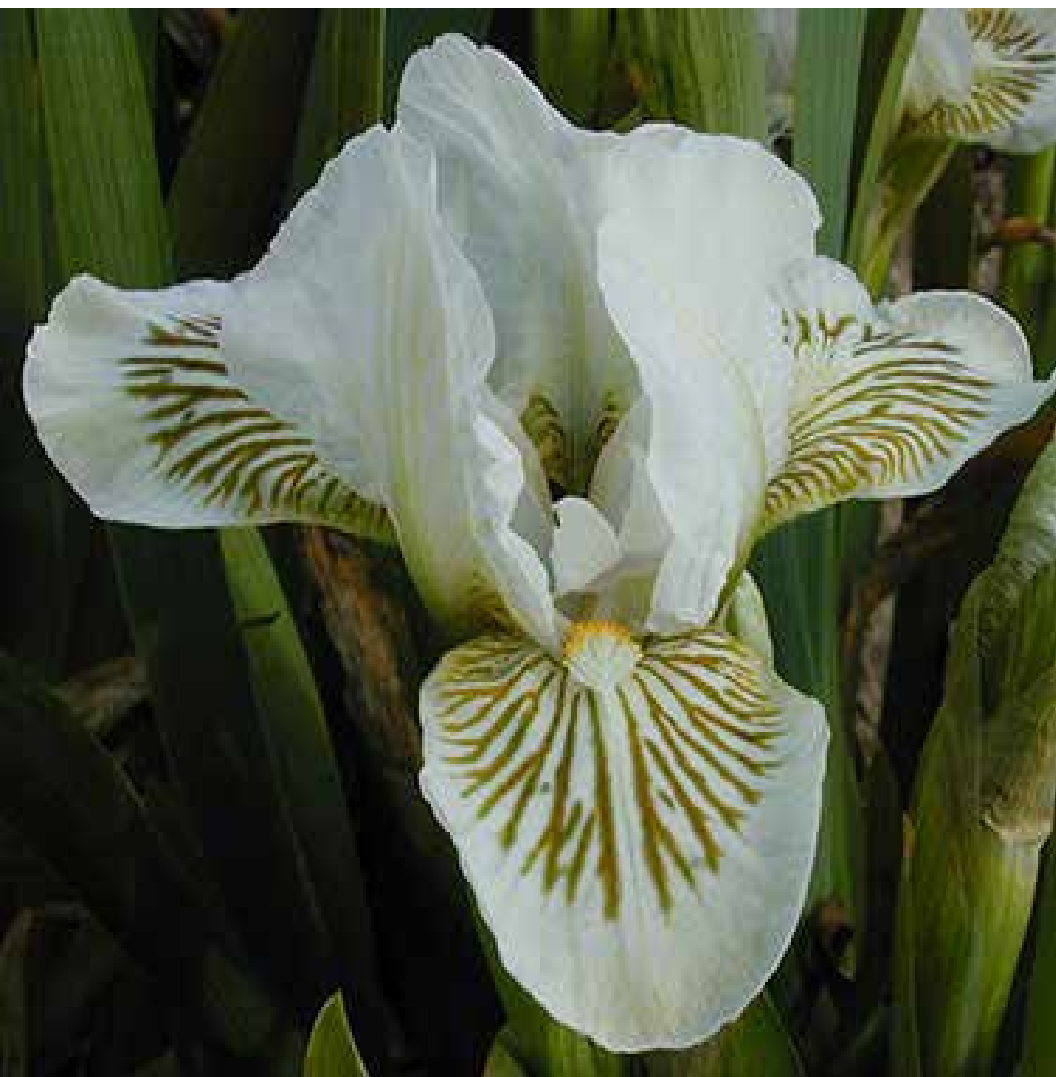
SDB Snow Tree (Sobek 1990)