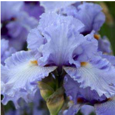
No Place Like Home (Black 2011) E L

Standards medium pink with pink style arms; Falls medium pink lightening to large white area around beard. Beards bright tangerine red.