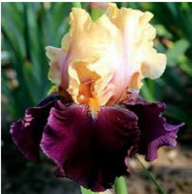
Pick Me (J McMillen 2017) M

Standards medium blue, style arms same; Falls near white with green veining and light blue edging; beards yellow in middle and throat, white at the end