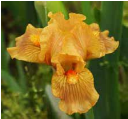
Tiny Titan (Aitken 2002) E M L

8" Bright orange self with darker fall lines HM AM Cap-W