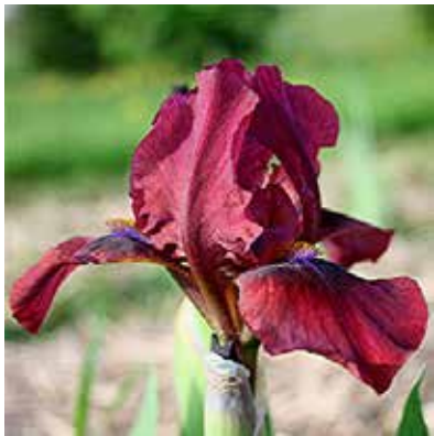
Lady In Red (Willott 1973) M

12" Standard amethyst violet; Falls red blending to black at the hafts; beards amethyst, slight fragrance HM AM