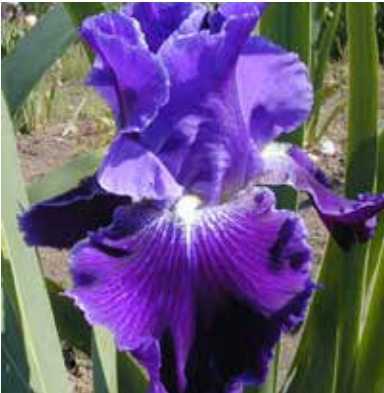
Daughter Of Stars (Spoon 2001) E M