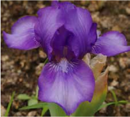
Blend of Blue (Aitken 2012) M