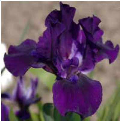
Forever Royal (Chapman 2016) E