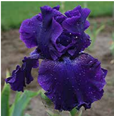
Hollywood Nights (Duncan 2001) M

White self with falls heavily veined and washed greenish-yellow; beards bright coral