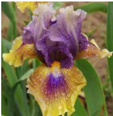
Blueberry Flambe (Chapman 2015) M

Red Black self; falls velvety black; beards orangey-red HM