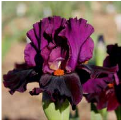
Banshee (Smith 2005) M

Medium blue self, beards orange in throat, pale blue at end