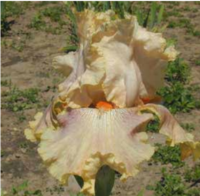
Buckskin Babe (Chapman 2007) M

Bi-colour Standards bright medium yellow Falls bright red - maroon with lighter streaking; 1/4" tan edging Beards golden yellow