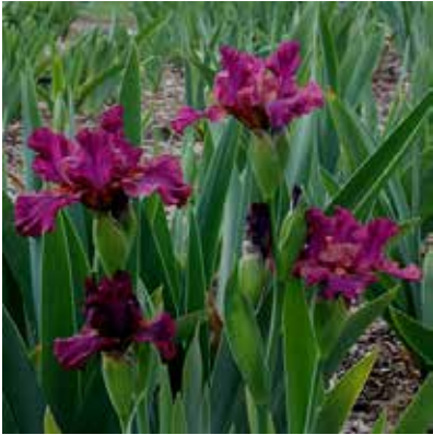
Revved Up Rose (Black 2010) M