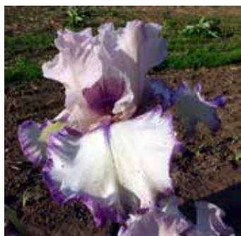
LAVENDER STARDUST (John McMillen, R. 2015). Sdlg. 121PL15. TB, 36" (91.5 cm), ML. S. light misty lavender-pink; style arms lilac; F. white ground peppered with a few purple dots, deep purple streak extending 1/2 way down petal from end of beard, medium red-lilac plicata edge; beards red in throat and middle, ends purple, hairs tipped white. Darcy's Choice X 074210: (Gnus Flash x Fogbound).