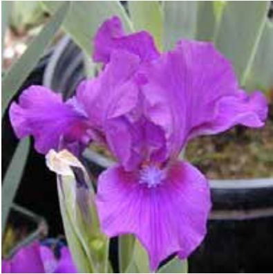
Bourgeois (Black 2003) M

14" Claret Purple with darker center and veins; lavender beards. HM AM