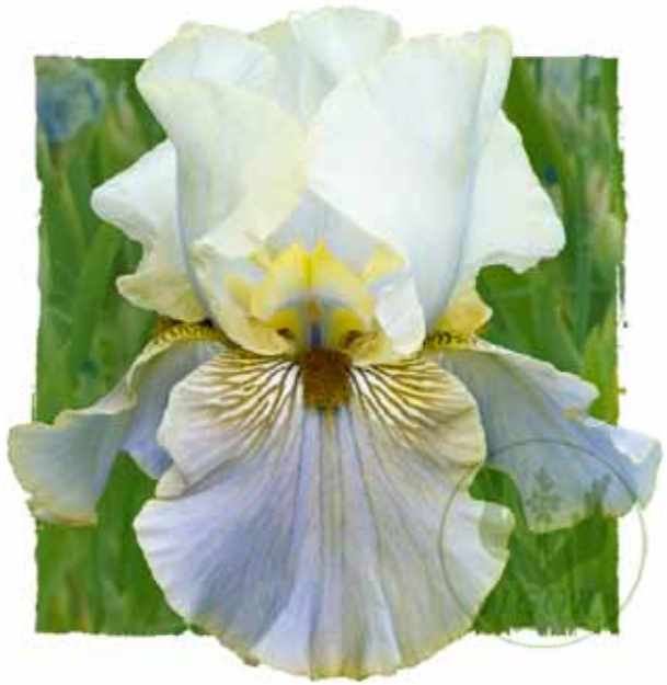
Green and Gifted