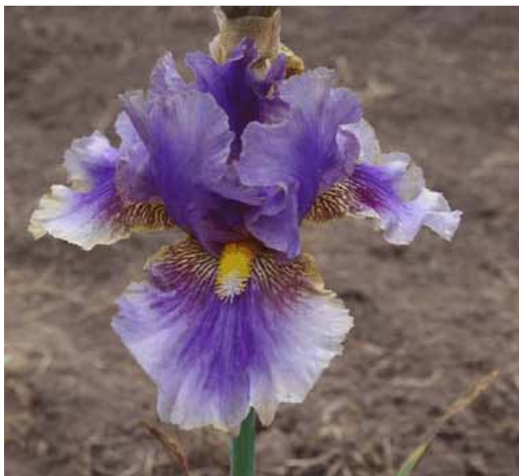
Seedling 0777109 is a blend of ruffled colours with its magenta purplish blushes, cinnamon veined hafts and golden white-tipped beard. Perhaps it's the paling edges of the falls edged in yellow which enhances its uniqueness. [Don McQueen digital 12863]