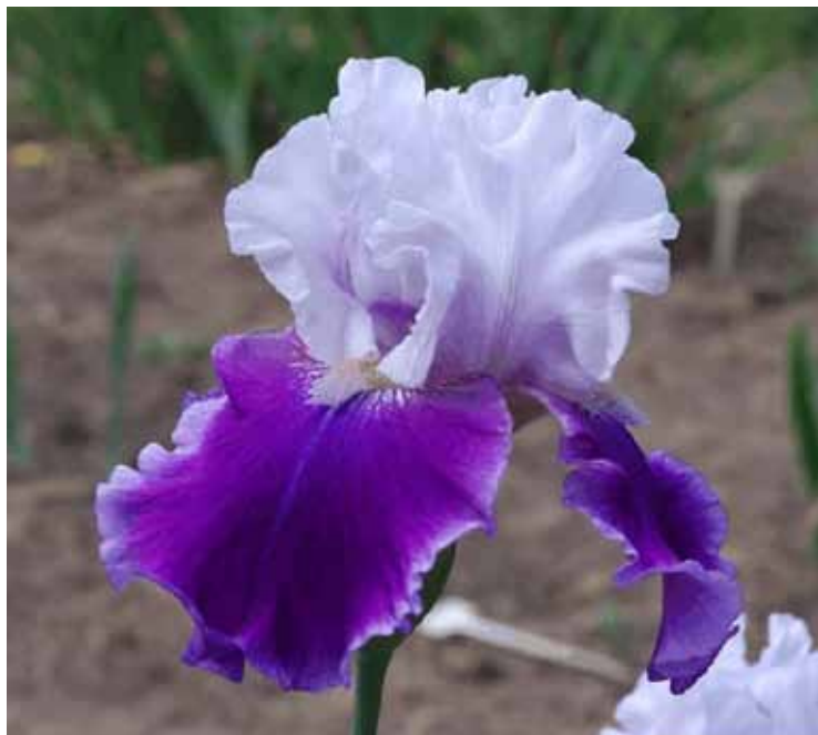
Seedling 062310, endowed with icy blue standards and pansy purple falls, has other interesting features on its falls, particularly the bright blue mid rib streak and the icy blue edging. [Don McQueen digital 12925]