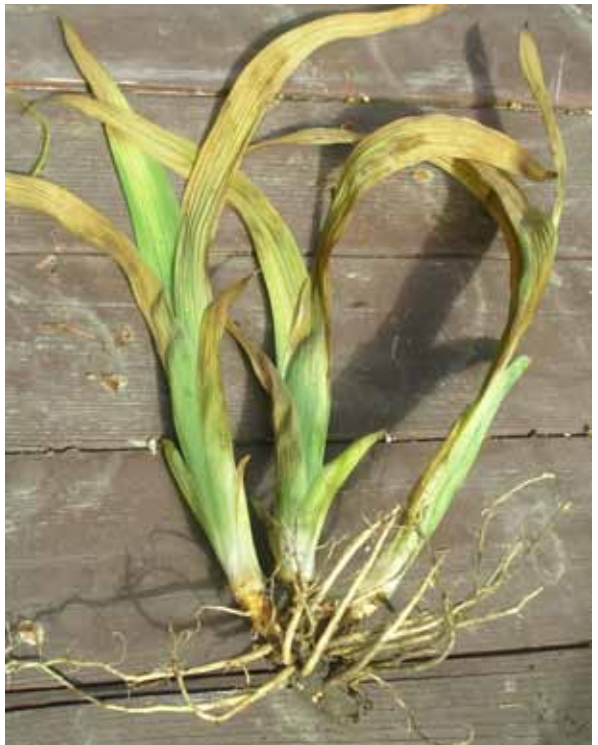
Full-blown iris Scorch

Several CWIS members reported what appears to be an outbreak of iris Scorch this season. Reports were received from Winnipeg and Brandon in Manitoba as well as Regina in Saskatchewan. This is the second time in my 20 years of growing iris that I personally have experienced it and the victim this time was I. reginea . In one week my reginea went from slightly sickly looking yellow tips to more than half the plant being affected. My thoughts