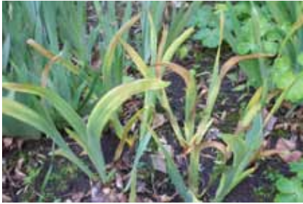
Iris Scorch starting with yellow tips

The website continues to draw enquiries from the public wanting to grow iris in cold climates. Now that I can do the editing myself, it can be updated more quickly and easily. If you haven't had a chance to see it and are so inclined, check it out at www.canwestirissociety.info . Very basic but I am learning as I go along. Everything you always wanted to know about us but were afraid to ask is located here. Browse the back issues of the Aurora newsletter or past rhizome sales and feel free to send us comments. They are appreciated. Our membership now sits at 70 hardy souls from across the west, with about half from Manitoba.