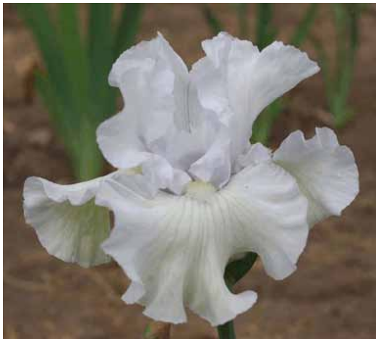
Showing some subtle colouration and form of FOG-BOUND, seedling 0711 has soft bluish white standards and greenish cream centres in the falls.