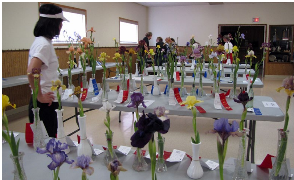
Can-West Iris Society 4th Annual Show