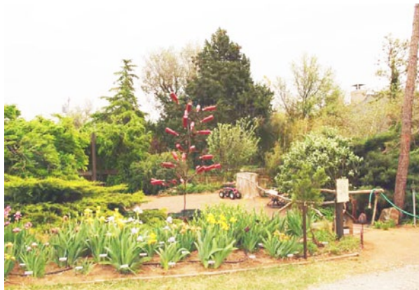
Stouts' Dancing Tree

I did tie for first place in SDB category with Limesicle . It is an older one of my introductions (2000), and I only sent it as an afterthought for people to see. But its intriguing green colour certainly caught everyone's eye. It tied with Lingo , an SDB by Keith Keppel .