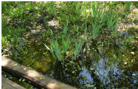
Watery nursery bed