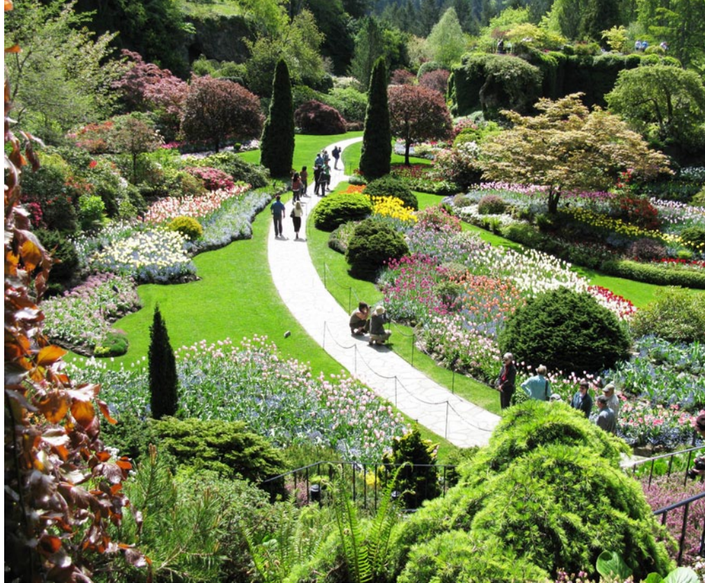
Butchart Gardens, Victoria, B.C.