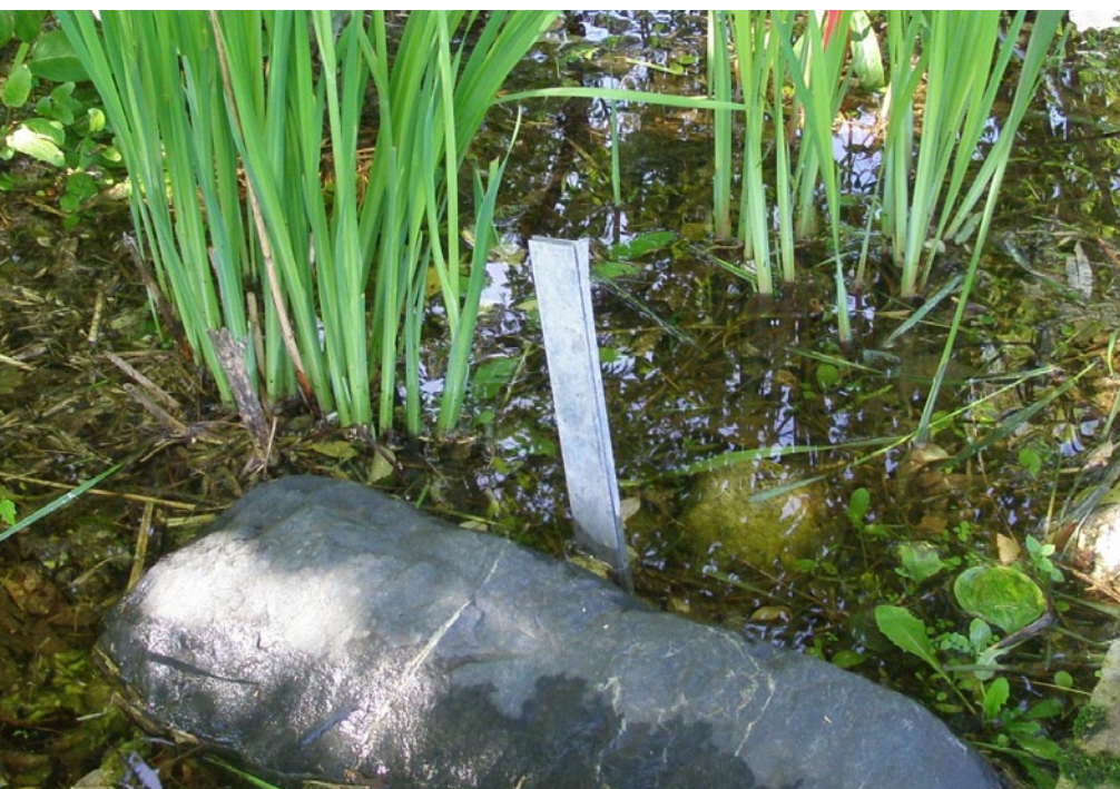
Flooded siberian bed