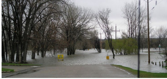
View down 26th Street – May 10, 2011

I couldn't even step into the bed without sinking past my ankles. And it continued to rain throughout the month of June making it one of the wettest on record. Please see the photos I have included to experience just a wee bit of my spring.