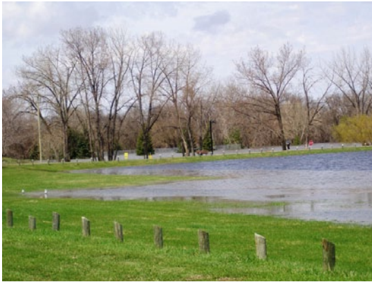
McDonald Avenue, field behind the house

Despite the weather and associated woes, the Can-West Iris Society held its 4th annual show in Winnipeg. There were 121 entries of more than 90 varieties that encompassed all classifications except the Aril and Species-X classes. Thirteen exhibitors participated. (See awards in the following article.)