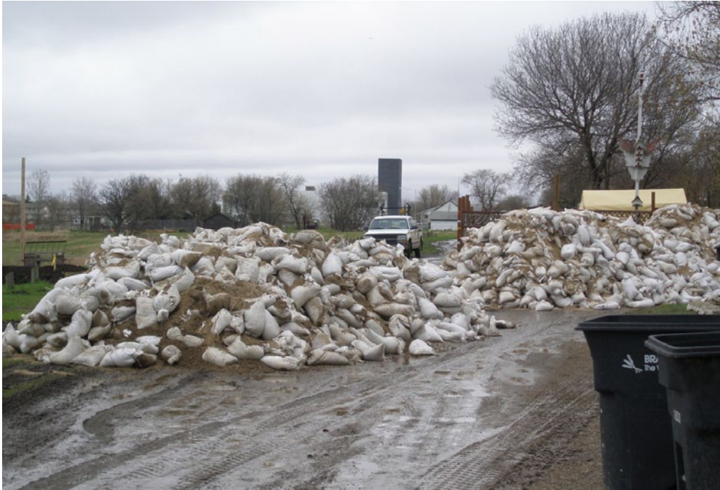
McDonald Avenue, back lane

Whenever I try to find the words to describe the year 2011, the only ones that seem appropriate is “annus horribilis”. If you have a good memory, you might remember that is how Queen Elizabeth described the year 1992 in her Christmas address that year. Well, it certainly has been that here in south western Manitoba so far! In the early spring it was a late snow storm on May 1st. In mid-May it was a precautionary evacuation due to the threat of flooding from the Assiniboine River. It never did get really close (just the other side of our back lane), but I was unable to even visit the garden for 3 weeks. The day after we were allowed back, it was off to Victoria for the AIS Convention. That has and is the bright spot of 2011 but you can read all about that elsewhere in this newsletter. ►