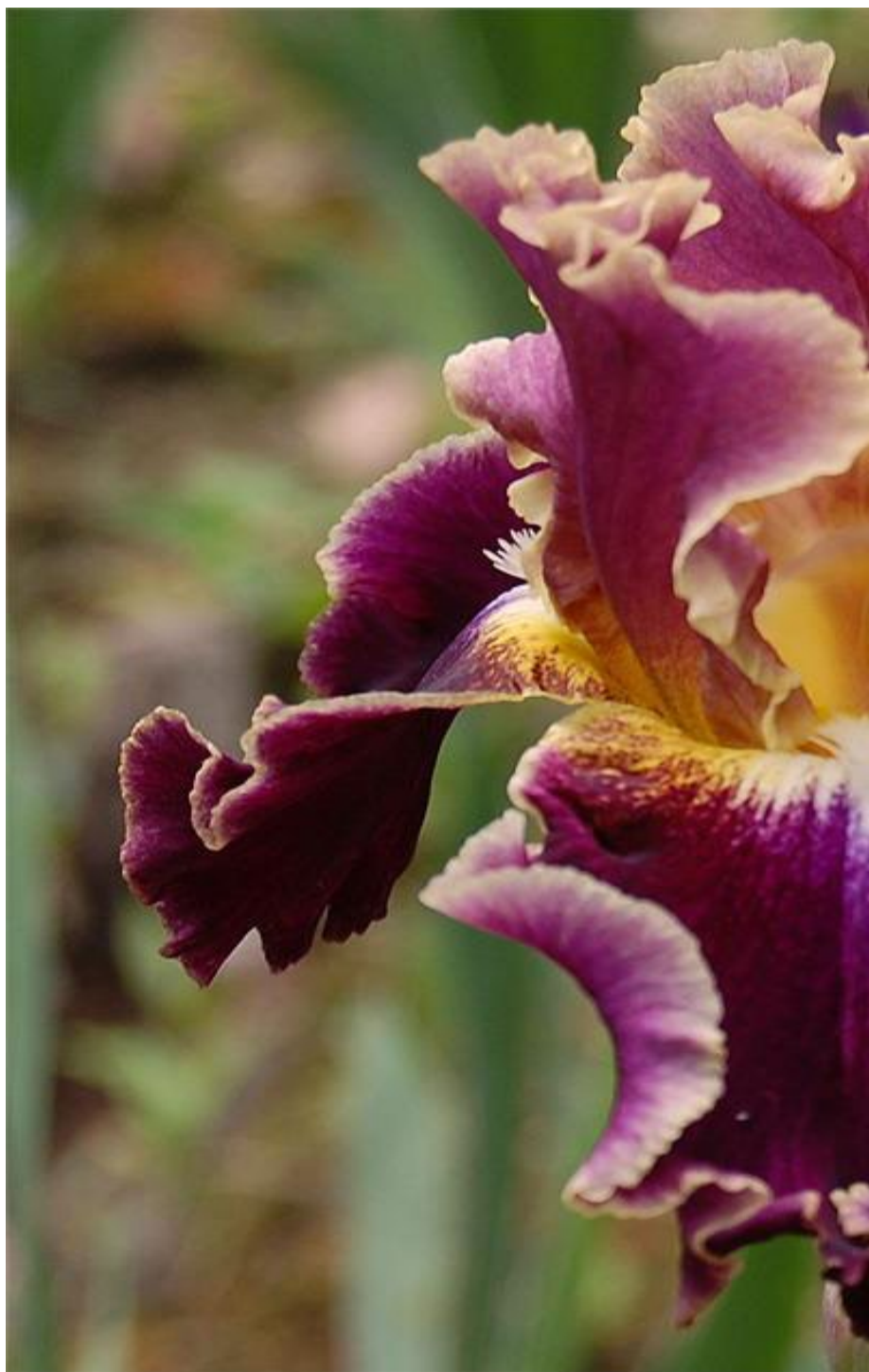
MONTMARTRE (Keith Keppel 2008) tall bearded iris