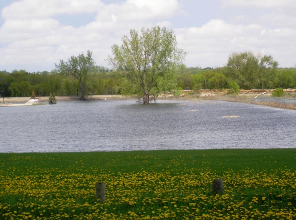
Assiniboine River getting close