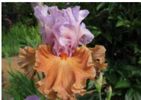
Adoree [TB 2009, Blyth]

I was caught by our sudden snow fall which has not let up a few flurries each day. I have approximately 40 irises in pots that never got covered. I am hoping at the first melt I can at least get the pots into the shed and save them. At the moment they have to survive under a foot of snow.