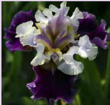
JJ05: TB 34" M Nicely ruffled pansy purple falls, white standards with gold glitter open to display striped royal purple and gold style arms.