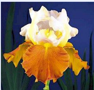
Photos: These are Tall Bearded type of iris; all of them are AIS registered cultivars top left: Kitty Kay | top right: Sea Power | bottom left: Midnight Oil | bottom right: Fall Fiesta

...Looking for unique and beautiful irises like these ones? Come out to our annual sale August 14 th , 2011 @1:00 P.M.