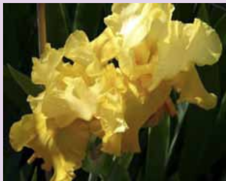
KY06: TB 35" E-M Vibrant sunny yellow bitone, white rays at golden beards.