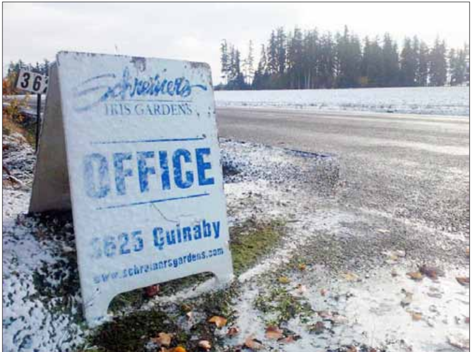
Photo: Winter is here ...even in the Pacific Northwest iris paradise.

If you need a little guidance selecting from the huge number of iris varieties that you find in the catalogues then consulting the AIS Awards listing that is published each