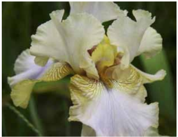
GG051: TB 37" E-M Purple based foliage, butter-cream self with glitter on standards, antique gold tiger pattern on hafts of falls, mauve translucent haze on centre of falls and standards.

If I do not have the listing of Irises for this bulletin it will be in the May Bulletin and may even send out special sale notification. I am sure we are all thinking spring even though it is a few months away. Look for more pictures and details of the convention in this issue. This year we are adding two floral design classes to our Flower Show. If anyone would like to have visitors to their garden(s) during the bloom season; please let us know. I am sure those listed as Canadian sources would have tours but phone for times and bloom before going to be sure someone is home to show you around.