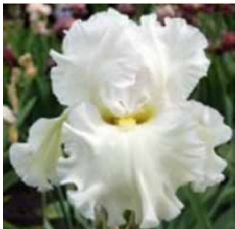
New introduction: Chased but Chaste

Wedding Kiss , a romantically pale lemon cream self with just a shade more colour of the standards and reverse of the falls. A soft and pleasing little child of Sugar Bomb , blooming mid to late season. Love Changes with its pure white wide open standards shows just a bit of lavender stippling around big tangerine beards as its only colour, the falls otherwise just ever so softly blushed with lavender over white.