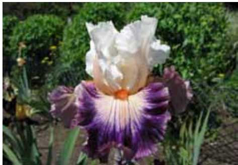
Pop Idol [Ghio 2008]

If you are even thinking of attending I suggest you register as soon as possible as there is a limit as to how many can be accommodated. For more information go to either the BCIS web site: www.bc-iris.org or the AIS web site: www.irises.org