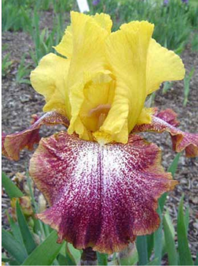
iris Caramba © www.hornbakergardens.com Princeton, Illinois

Think in terms of pigments: you are colouring your irises with two different “brands of paint”. One “brand” is water soluble (it comes in blue, lavender, violet, blackish purple, orchid pink, the cool colors) and the other is oil soluble (think warm: cream, yellow, pink, orange etc.) Each brand of paint has its own patterns (plicatas are cool pigments, the Joyce Terry pattern is warm) learn to think in terms of layering one type of pigment over the other. Reddish violet plicata plus yellow ground gives a brown and yellow plicata. Want a vibrant “iris red” self? Produce a bright dark lemon gold self and a dark rosy purple self in the same flower. The overlay of colors gives a very red effect. Hint: to understand the effect better, look at the hafts of a plicata. There is almost always a white area beside the beard. Compare the plicata (water soluble pigment) markings on white with the same markings on the adjacent oil-soluble warm pigment ground. In the variety Caramba , perilla purple dotting on white becomes java brown on the yellow ground. Look at the other plicata combinations to learn more.