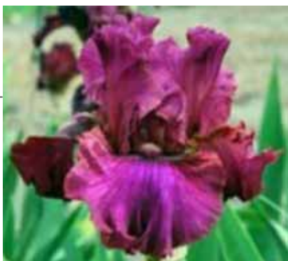
New introduction: Prince of Hearts